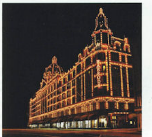
An interactive Harrods store guide with GPS navigation, an events list and a tour with audio commentary ( harrods.com ).