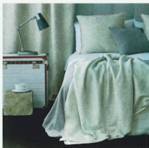
De Le Cuona 's app showcases its fabrics and hot new accessories, plus you can request samples ( delecuona.co.uk ).