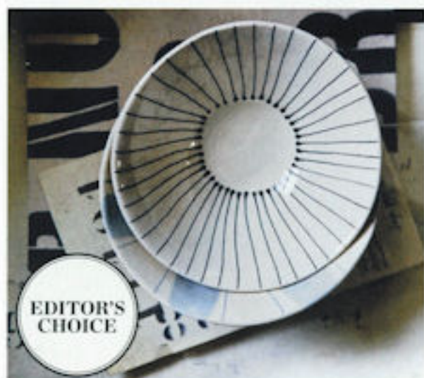
Shop Style brings together brands from Toast (pictured) to The Conran Shop, all under one digital roof ( shopstyle.co.uk ).