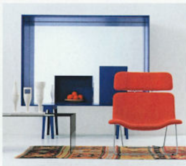
Browse Cappellini 's newest collections to find the pieces you like. Then look up your nearest store and buy them ( cappellini.it ).