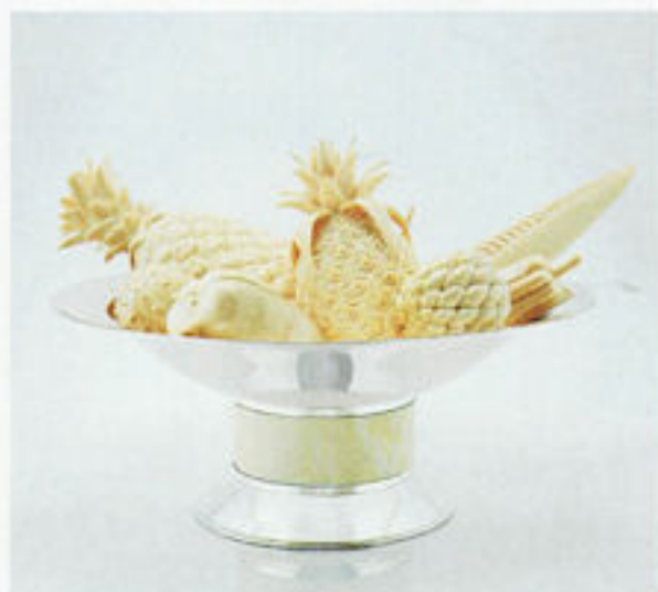
Lapada , The Association of Art and Antiques Dealers, helps you find specialist dealers and browse stock ( lapada.org ).