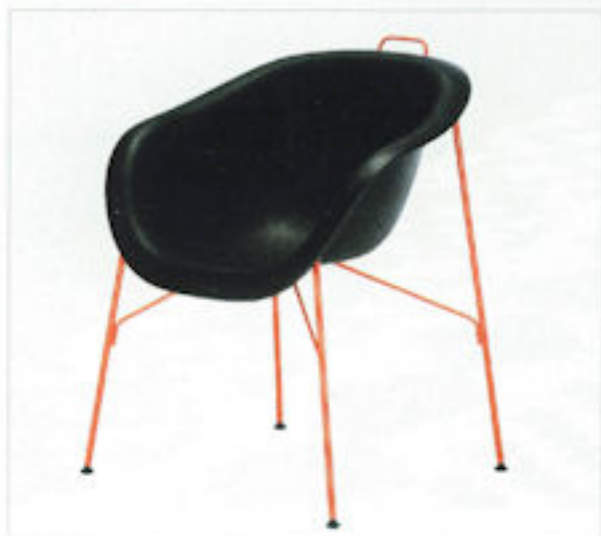
Yoox.com 's design-led products include this 'Eu/phoria' chair by Paola Navone. Use the app to create a 'Dream Box' wish list.