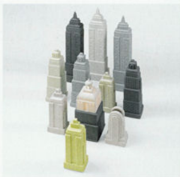
Spanish porcelain brand Lladró lets you 'try out' its ceramics at home by adding them to a photo of your space ( lladro.com ).