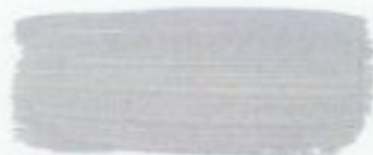
'Gris Plus Clair No. 23 + 6kg Blanc' paint, £84 per 6kg, Emery & Cie ( emeryetcie.com )

Bring warmth to walls by replacing white with shades of greige, from palest grey to deep earth tones.