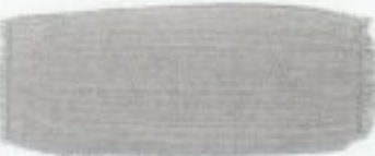
'Terre d'Ombre No. 21 + 15kg Blanc' paint, £84 per 6kg, Emery & Cie ( emeryetcie.com )