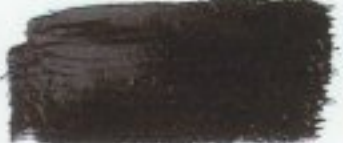
'Puce No. 18' gloss lacquer, £78 per 2.5 litres, Emery & Cie ( emeryetcie.com )