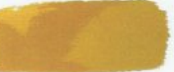
'Jaune Hardi No. 31' gloss lacquer, £78 per 2.5 litres, Emery & Cie ( emeryetcie.com ) ▶