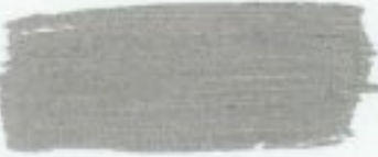
'Poussiere No. 20 + 6kg Blanc' paint, £84 per 6kg, Emery & Cie ( emeryetcie.com )